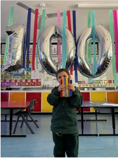
100 Unifix cubes.