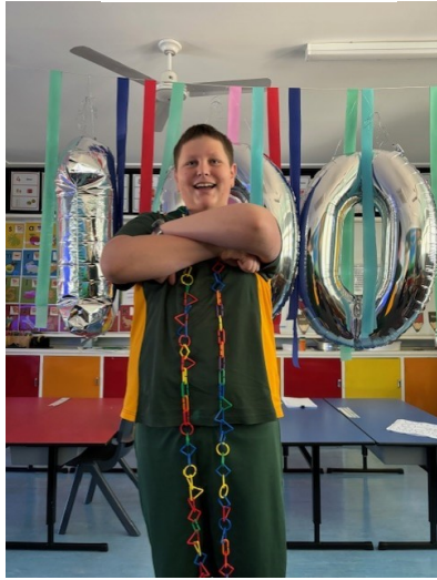
100 shape links.