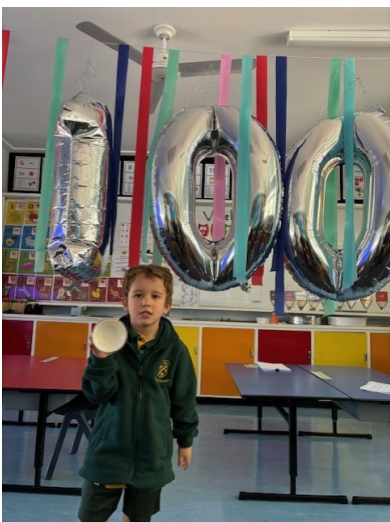
100 cup-cake trays.