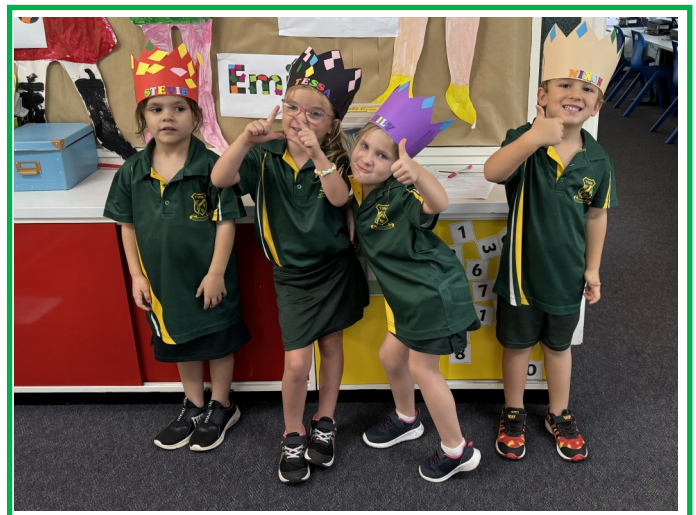
Young Writers Workshop 1